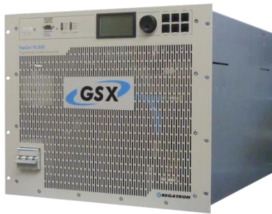
TC.GSX Series unit with optional Human Machine Interface (HMI)