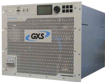
TC.GXS Series unit with optional Human Machine Interface (HMI)