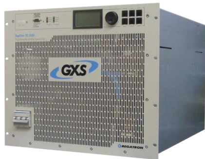
TC.GXS Series unit with optional Human Machine Interface (HMI)